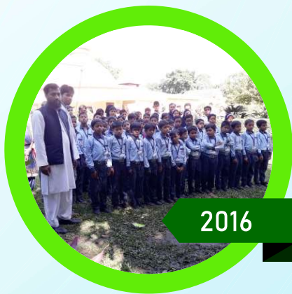
Science City, Siliguri

The school organizes annual educational tour for senior pupils by the teachers to give them an insight into the practical side of their theoretical knowledge.