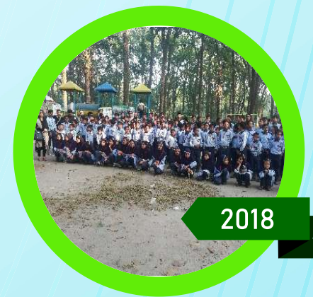
Bengal Safari, Siliguri