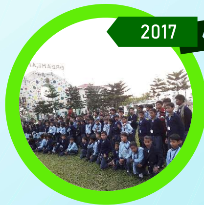
Dreamland Fun World, Siliguri